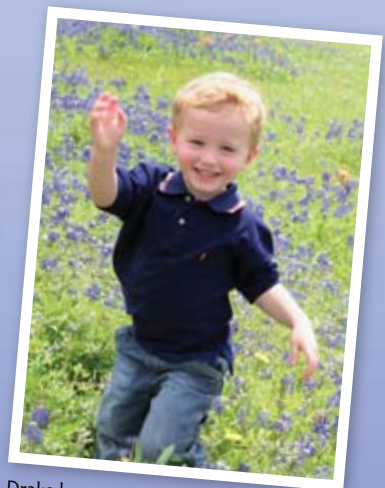
Drake loves running through the flowers